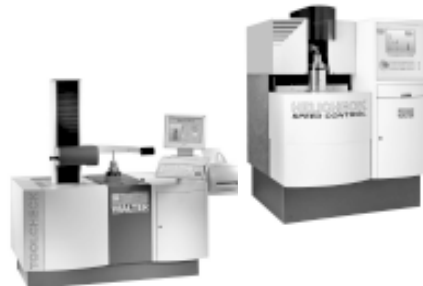
Heli Toolcheck (left) & Helicheck CNC measuring machines

WALTER GRINDERS, INC. FREDERICKSBURG, VA PH: 540-898-3700 • FAX: 898-2811 MIDWEST CENTER PH: 248-528-2120 • FAX: 528-2216 WALTER WEST PH: 714-996-4861 • FAX: 996-4863 WALTER MEXICO PHONE OR FAX: 55-655-9981