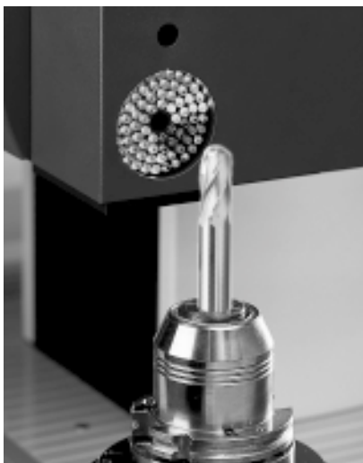
Heli Toolcheck measuring a ballnose endmill

New measuring software as easy as “Follow me!”