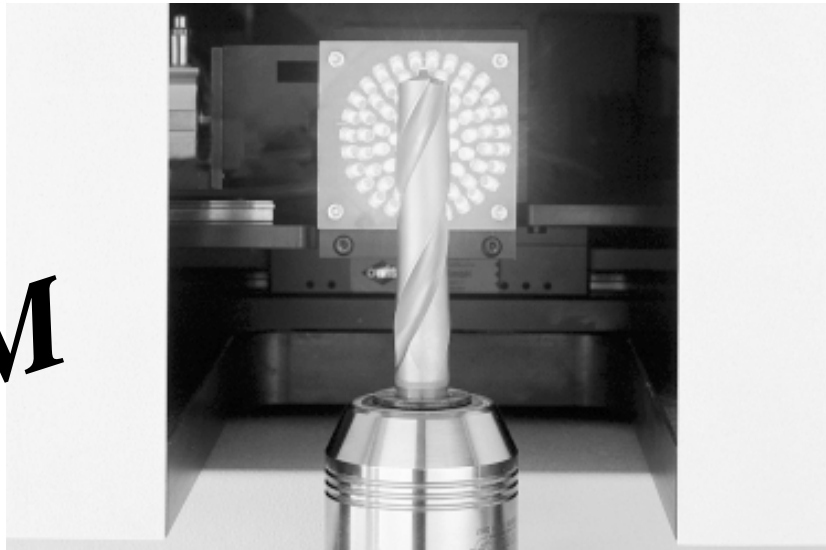
Helicheck measuring a drill

New measuring software as easy as “Follow me!”